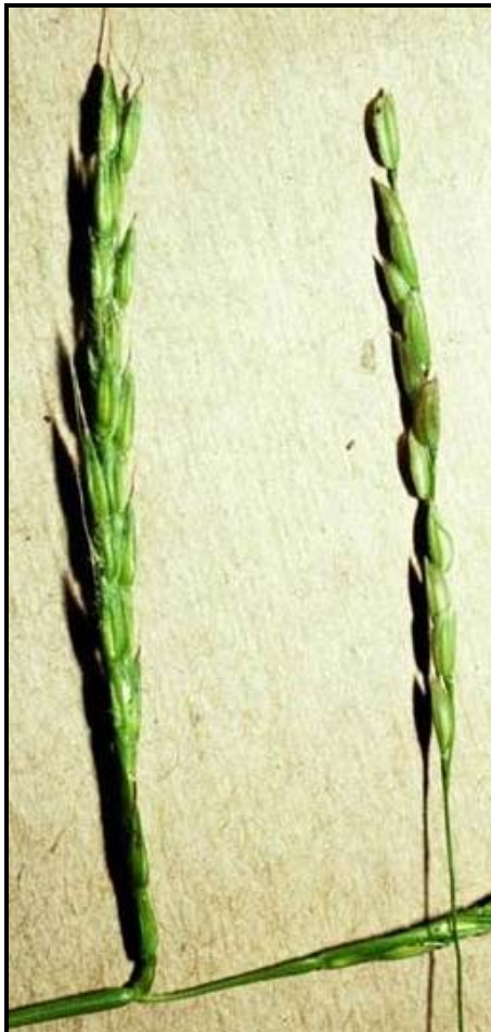
Comparison of terminal spike-like branches of Microstegium vimineum (bottom) & open panicle of Leersia virginica (top).