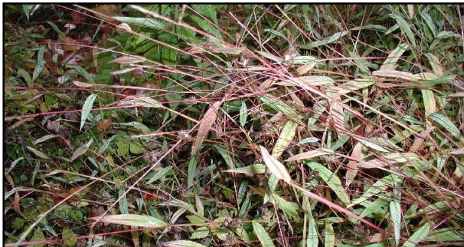
Yellowish to pale purple fall color of Japanese stilt grass.