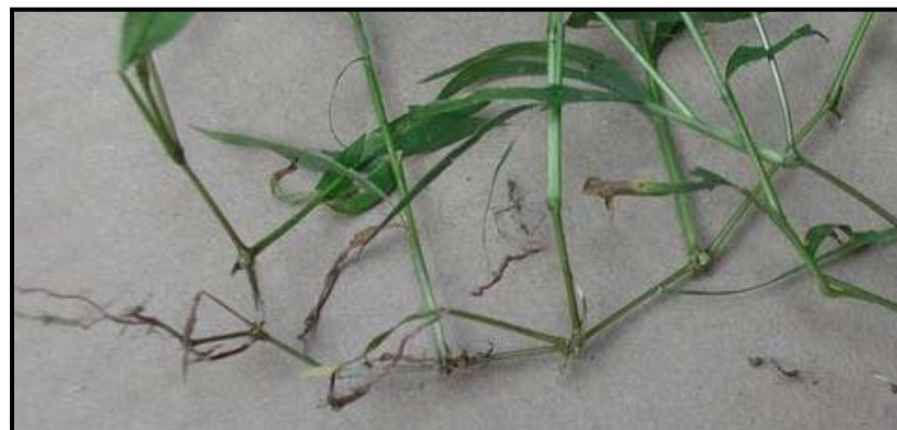
Japanese stilt grass is an annual with fibrous roots.