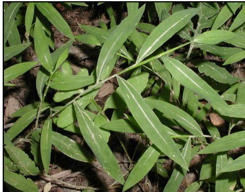
Japanese stilt grass foliage.