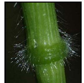
Smooth Japanese stilt grass nodes (left) and hairy white grass nodes (right).