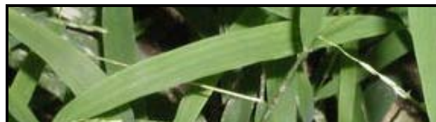
Japanese stilt grass foliage (top) and white grass foliage (bottom).