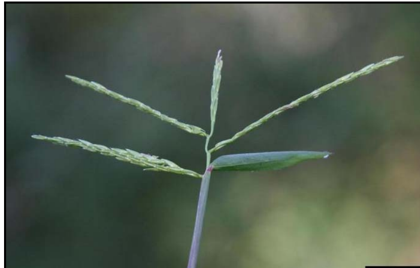
Japanese stilt grass flowers (left) & white grass flowers (right).